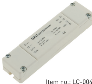
Item no.: LC-004-012