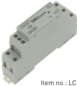
Item no.: LC-004-803