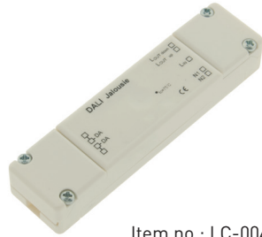
Item no.: LC-004-804